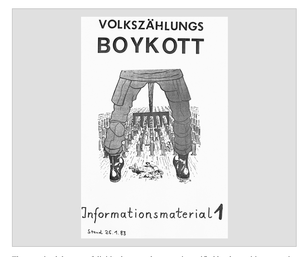
Figure 1: »Volkszählungsboykott«, 1983<sup>54</sup>

The perceived dangers of digitised census data were intensified by the positive synergies among the various information technologies coming into use at the time. One of the most controversial elements of this assemblage was the new national ID card, which had just received final approval by the »Bundesrat« in February 1983. The card had originally been proposed as a way of facilitating interaction between citizens and various state offices. However, the card took on an entirely different meaning with the intensified concern for domestic security in the 1970s. For the police, the most important advantage of the card – aside from the fact that it was much more difficult to counterfeit than the identification documents then in use – was the fact that it was machine readable: all that a policeman or border guard had to do was to swipe the card through a reader, which was connected via new communications technologies to the national police information system, in order to instantly verify the identity of the person and obtain all other relevant information on the individual. Since the identities of more people could be checked more quickly, the ID card promised to enhance police control over the country's borders and to make their control over the internal territory of the state more intensive and continuous.