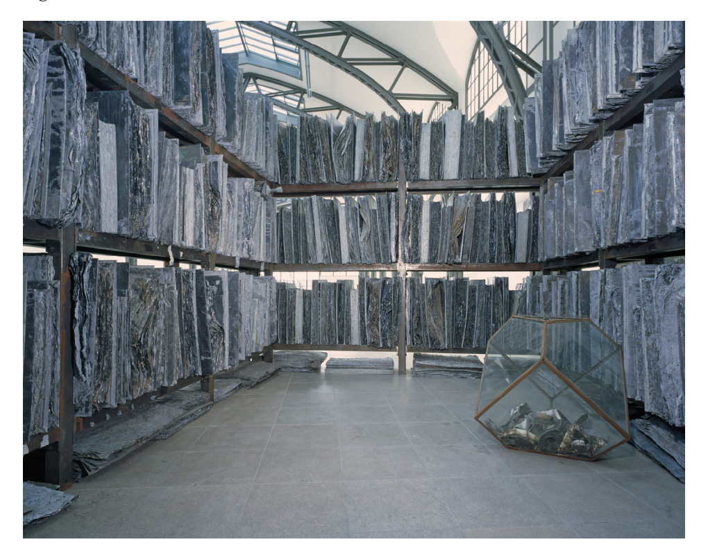
Figure 5: »60 Millionen Erbsen«, 1987<sup>138</sup>

agentur für Arbeit«); and household information were be constructed from individual information on the basis of a shared address and other data.<sup>139</sup>