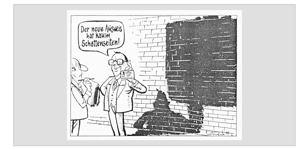
Figure 2: Der neue Ausweis hat kaum Schattenseiten<sup>55</sup>

As one pamphlet warned in apocalyptic language taken from Aldous Huxley rather than Orwell, the »cabylon« of new information technologies and the creeping progress towards the ability to instantaneously register each and every member of the population was bringing about the advent of a »brave new world«. The dystopian future that this group of protesters saw looming before them took the form of