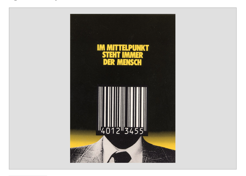
Figure 4: Poster by Klaus Staeck, 1981<sup>136</sup>

135 Ulrike Erb, Volkszählung zwischen den Interessen von Volk und Staat. BVG-Verhandlung zur Volkszählung, 19.1.1984, AGG, B. II. 1, Nr. 3255; Die Grünen, Nur Schafe werden gezählt. 136 Reprinted by permission of Klaus Staeck.