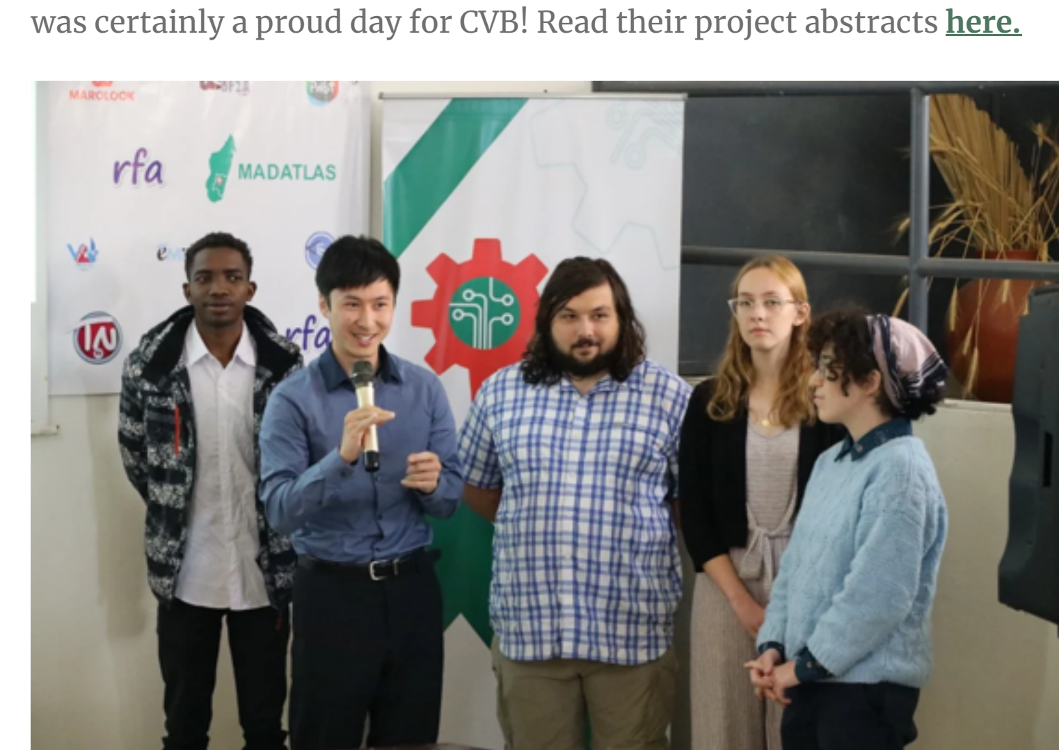
Pivot Hosts Bioinformatics Workshop @ CVB

On June 28th, our SBU Summer Study Abroad students presented the results of their independent research projects to faculty, staff, and students at the University of Fianarantsoa. At the end of the event, each student was given a certificate of completion for the program. It