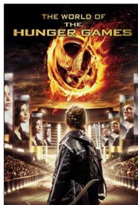
New movie-related cover for The Hunger Games !

The Hunger Games is the first book in a trilogy written by Suzanne Collins. The novel, released in 2008, tells the story of 16-year-old Katniss Everdeen, living in a post-apocalyptic world, who takes her younger sister's place in the deadly televised Hunger Games. The winner of the competition receives enough food and material goods that their family will never have to worry again, but this comes with a price - they must choose between survival and humanity. All three books in the trilogy - The Hunger Games , Catching Fire and Mockingjay are now available for 20% off at the University Bookstore.