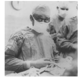
Favaloro's saphenous vein bypass grafting (CABG)