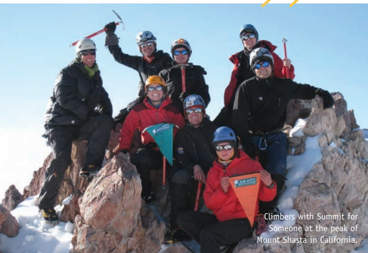
Climbers with Summit for Someone at the peak of Mount Shasta in California.

“You raise money for a great cause, your guided climb is free except for travel costs, and you receive all the equipment you need.”